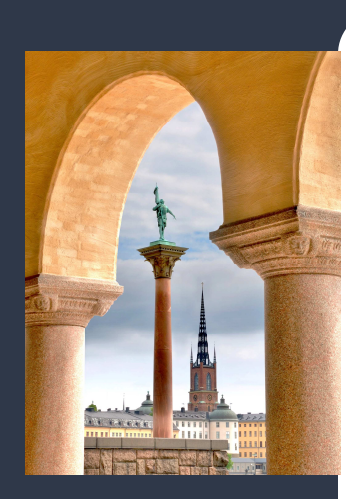
Why Should You Book Your Vacation with Go-today?

Ease of Use Experience Flexibility Peace of Mind Destination Expertise